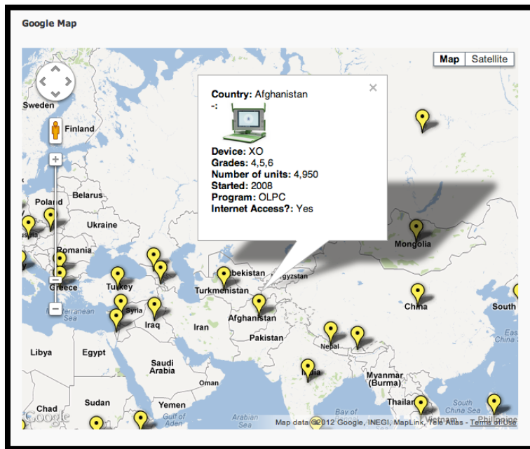
Figure 4. Interactive Google Map of the database